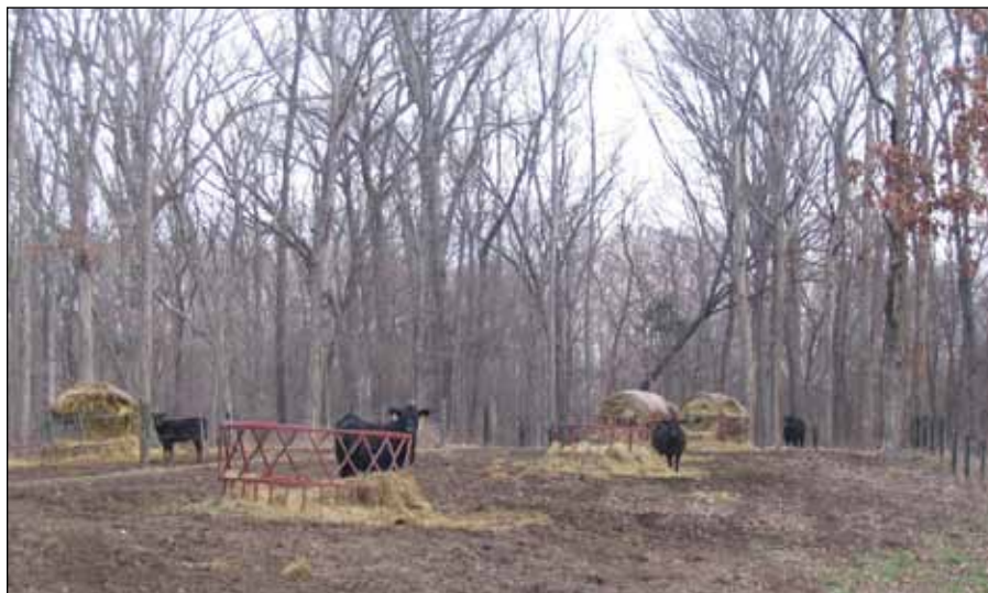
Figure 1. This woodland feeding area was installed to provide a shelterbelt, also known as a windbreak, for two adjacent pastures.

Vegetation loss —Cattle eat ground-level vegetation and shrubs and remove the forest floor's litter layer, which is composed of leaves, moss, and organic soil. The loss of this vegetation and litter layer reduces the soil's capacity to absorb rainwater, which could lead to erosion and surface water pollution.